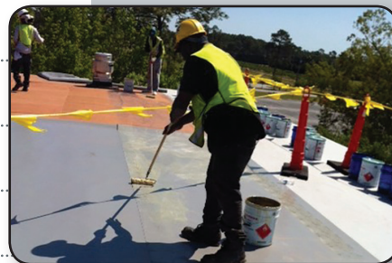
Fort Stewart Roof