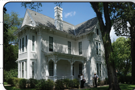
Harry S Truman House